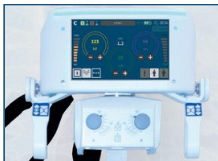
10.1" Device User Interface to access all System functions