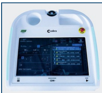
22" Touch-screen Monitor with full acquisition software